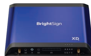
Expanded I/O Package