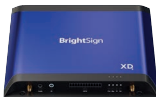
Standard I/O Package